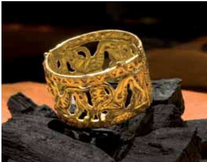
Bactrian bangle with stylised lions, 4th /2nd centuries BC, Diergardt Collection

European prehistory and prehistory of the Rhineland. History of Roman art, culture and urban settlements. Largest collection of Roman glass and pottery worldwide. European and German jewellery from classical antiquity and the migration period. Frankish finds from Cologne and the Rhineland.