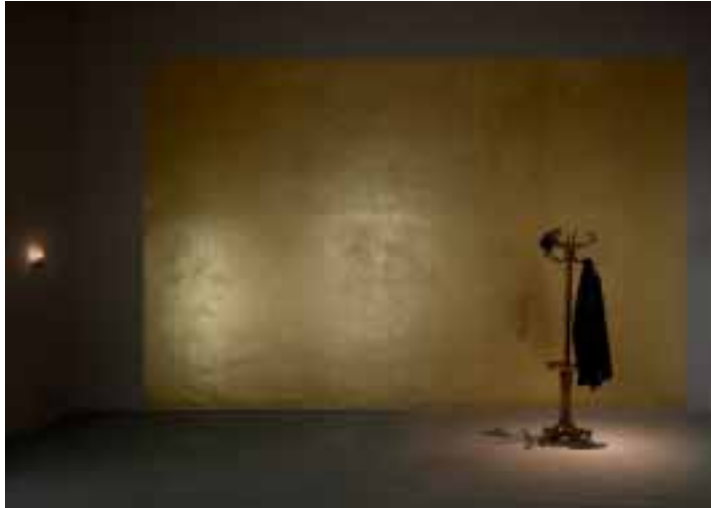
Immer ausgestellt (always exhibited): Jannis Kounellis, Tragedia Civile (civil tragedy), 1975

The collection ranges from late antiquity to the present day, from Romanesque sculpture to spatial installations, from medieval panel painting to "radical painting", from Gothic ciborium to articles of everyday use from the twentieth century. The search for an overarching order, based on measure, proportion and beauty is the linking element in artistic design and the guiding principle.