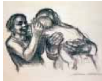
Kollwitz – Familienglück (the joys of family life), 1931