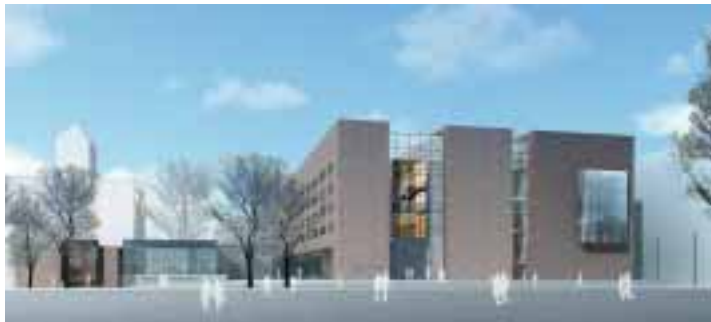
The new "Kulturquartier": Rautenstrauch-Joest-Museum and Museum Schnütgen (opening scheduled for spring 2010)

The Museum Schnütgen will present a unique view of the roots of Christian culture in its new, purpose-built museum and in the old "core" of the museum – the Romanesque church of St. Cäcilien. Rare and precious works of art will highlight life in the Middle Ages and the history of Christian faith. The exhibition offers a lively overview of the most important themes of seven