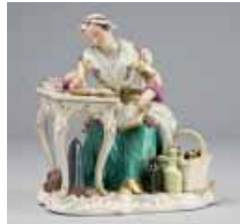
Merchant's wife doing the accounts, c. 1755, model by Johann Joachim Kaendler

The most important European porcelain manufactory of the 18th century was founded on 23 January 1710 by the Elector of Saxony and King of Poland, Augustus the Strong. He ordered the invention of porcelain and the foundation of a porcelain manufactory in Saxony to be jubilantly proclaimed by decree. As early as June 1710, production was taken up at the Albrechtsburg in Meissen. Soon, the “white gold” from Saxony was to become the most coveted luxury article at princely courts throughout Europe. On the occa-