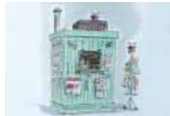
The kiosk as a social meeting point and source of infor- mation on the petty scandals of the “Stunksitzung”

In the early 1980s the ritualistic pomposity and ossified routine of Rhenish carnival met with increasing indifference, above all among young people who turned away from these traditional forms of celebrating carnival. As a reaction, a group of university students experimented with an alternative type of celebration and brought the “Stunksitzung” into being in 1984 under the motto “Karneval instandbesetzt”. “Stunksitzung” (literally: stink meeting) is a parodistic pun on