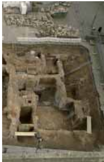
Remains of Roman and medieval settlements on the south side of the Rathausplatz (town-hall square)

The award-winners of the international architectural competition are already working on designs for the Archäologische Zone with a focal point for the presentation of Jewish culture on the Rathausplatz (town-hall square). In 2012/2013 Cologne's new cultural attraction will be presented to the general public. The excavation site on the Rathausplatz already provides visitors with a profound insight into the city's past.