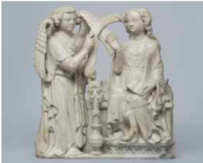
Annunciation from the high altar of Cologne cathedral, c. 1310, Cologne Museum Schnütgen, Photograph: Dombauarchiv Matz und Schenk

Christian art from the 4th to the 20th century Works of ecclesiastical art in gold, silver, bronze and ivory. Reliquaries, liturgical instru- ments and textiles, insignia of the archbishops and priests, medieval sculptures and Franconian grave finds.