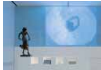
Entrance area of the redesigned Tanzarchiv.