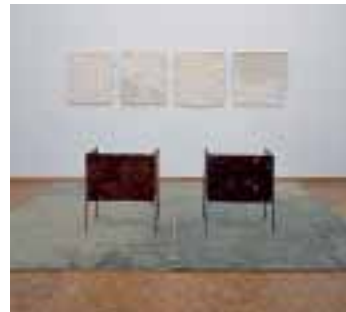
Franz West, Plural, 1995, Two armchairs: iron, wood, paint, four paintings, emulsion paint on canvas, floor: linoleum

The museum is to show the first great retrospective of Franz West in Europe. The exhibition is being created in close cooperation with the artist and his studio and archive. Over 80 works from all his creative periods and in the most varied of media and techniques show the complexity and autonomy of his work: graphic art, posters, Passstuecke, furniture, installations and works