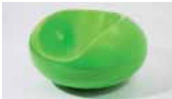
Easy chair “Pastille”, green polyester, reinforced with fibre glass, Eero Aarnio 1967, Asko Lahti, Finland

The Museum shows its new design department with the permanent exhibition “Kunst und Design im Dialog”. This offers visitors the opportunity to study design in its close relationship with works of fine art. Numerous key works created by pioneering designers such as Frank Lloyd Wright, Charles and Ray Eames or Philippe Starck are juxtaposed with outstanding works of fine art as by Piet Mondrian or Wassilij Kandinsky. This has been made possible by the gift of the private Winkler Collection. The concept was developed by the Vitra Design Museum at Weil am Rhein.