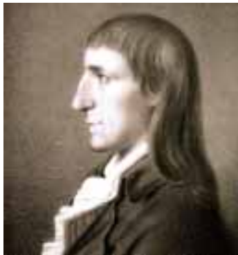
Johann Christoph Friedrich GutsMuths

Collection illustrating the national, international, and Olympic history of sports, with special emphasis on the 19th century till today: clothing, sports and game equipment, medals, certificates, sport awards, art posters and objects, graphic works, photographs, and other documents; Kölner Sportarchiv, Deutsches Basketball-Archiv, Heinz-Loosen-Archiv (collection on rowing)