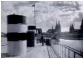
August Sander – maiden voyage of a Rhine steamer

Museum Zündorfer Wehrturm Hauptstraße 180, 51143 Köln (Porz-Zündorf) Telephone +49/ 2203 85250 info@zuendorfer-wehrturm.de