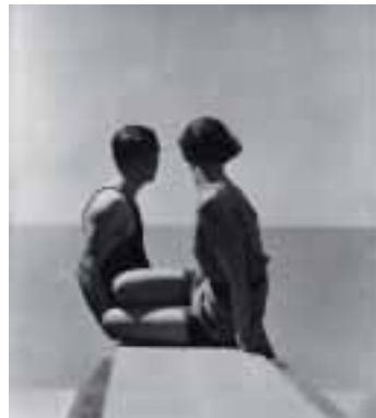
George Hoyningen-Huene, George Hoyningen-Huene with a model in a swimsuit by Izod, 1930, silver gelatine