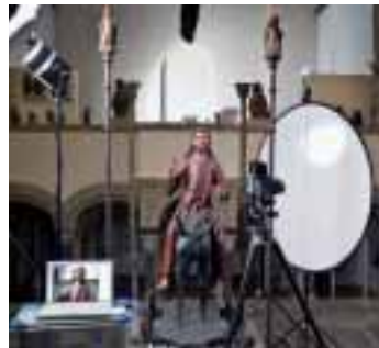
Photographers of the picture archives at work at the Museum Schnütgen: photograph of a work showing the entry of Christ into Jerusalem on Palm Sunday, c. 1520