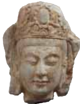
Head of a Bodhisattva, limestone, China, Northern Qi Dynasty (550-577), private collection, Switzerland, © Endrik Lerch, Ascona

30 October 2009, 10 a.m. to 5 p.m. Circa 1909 – Internationales Symposium Experts from international museums, which collected East Asian art as early as 1909, provide visitors with an insight into their history of collecting works of art.