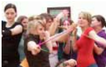
Museum workshop in Museum Ludwig

A guided tour for families every Sunday, and special programmes in the school holidays