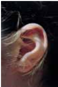
Isa Genzken, Ear, 1980, Photograph, Collection Charles Asprey

Highlights of the collection: German Expressionism, Russian Avant-garde, Surrealism, Picasso, Pop Art, Contemporary Art (1970s to the '90s), prints and photography.