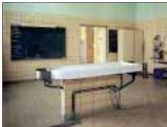
Amnésia: autopsies

Gestapo Prison Memorial: former Gestapo prison with the detention wing and the graffiti of the prisoners. Permanent exhibition "Cologne in the National-Socialist period" Changing special exhibitions, Library